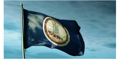
Top 14 Small Cities In Virginia

The article also praises high-quality local schools and low taxes on homes with a median price of $474,000, according to CNN Money. The Berkeley Heights train station is the center of town, and Manhattan beckons just 30 miles away.